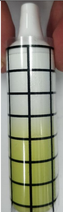
Left side view