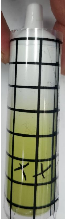
Left side view