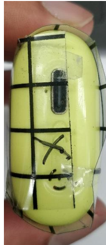
Right side view