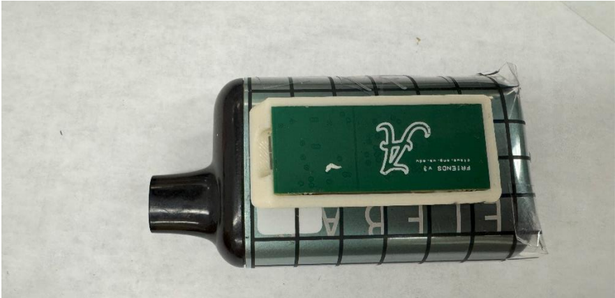
RF sensor Location: Front middle bottom