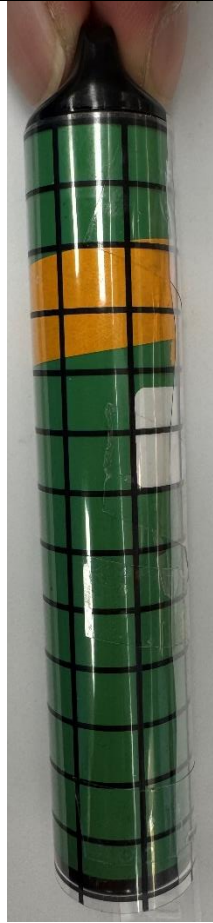
Left side view