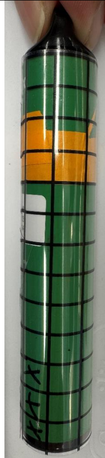
Right side view