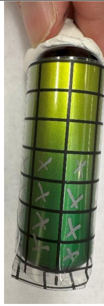
Right side view