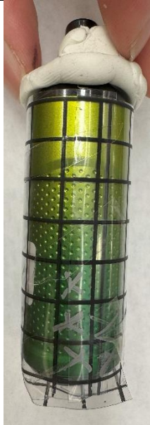
Left side view