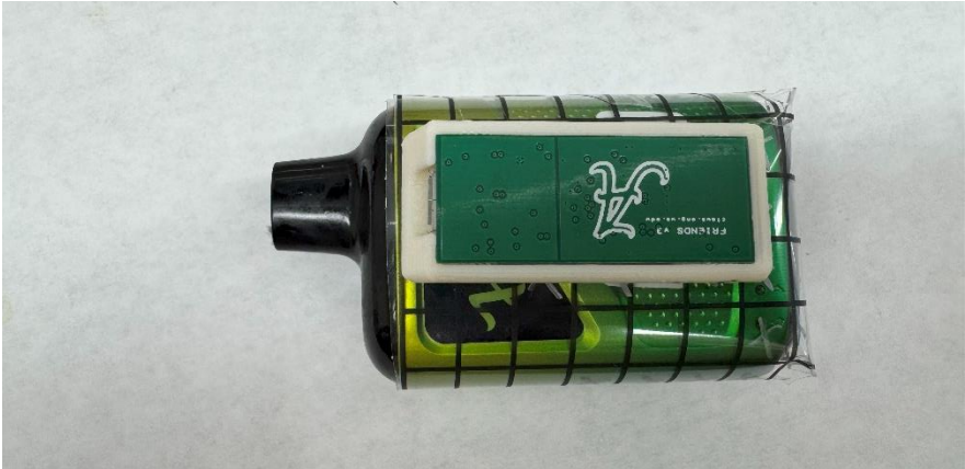
RF sensor Location: Front middle bottom