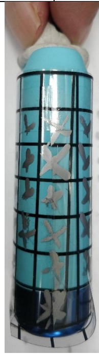
Right side view