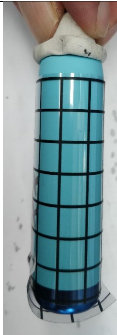
Left side view