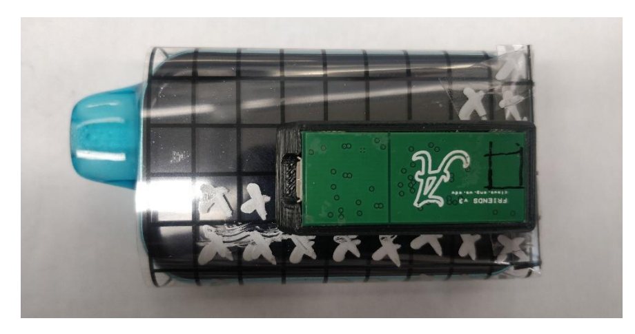
RF sensor Location: Back left bottom