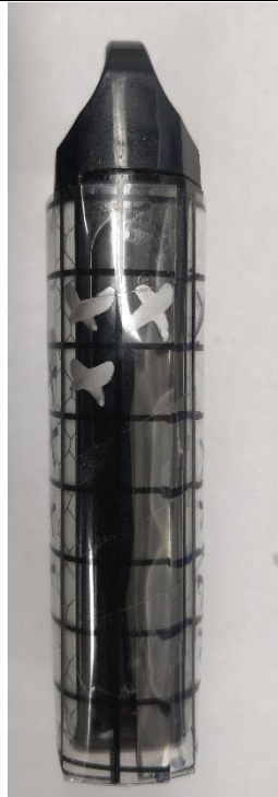
Right side view