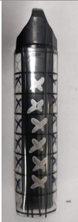
Left side view